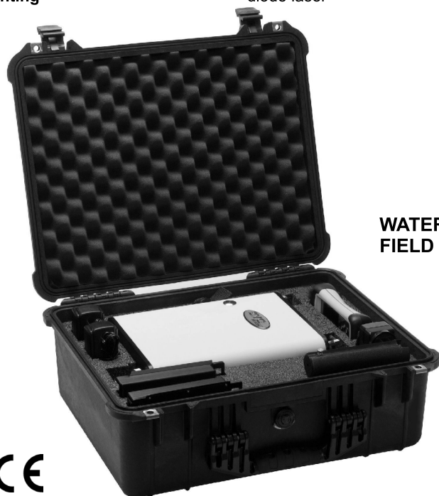
WATERTIGHT FIELD CASE