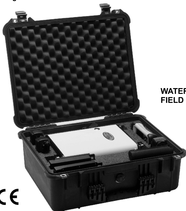
WATERTIGHT FIELD CASE